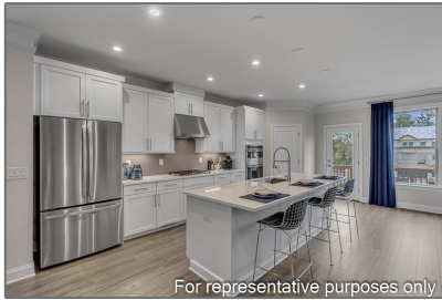
For representative purposes only